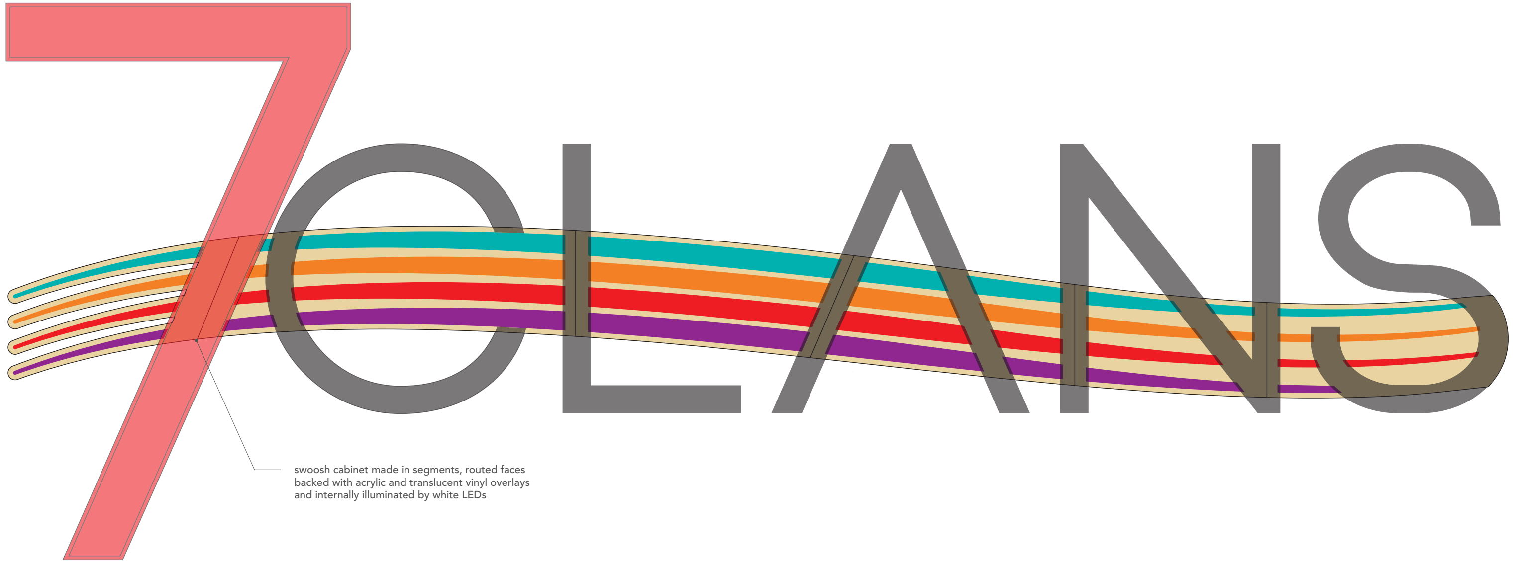
A | ELEVATION scale: 3/8" = 1'-0"