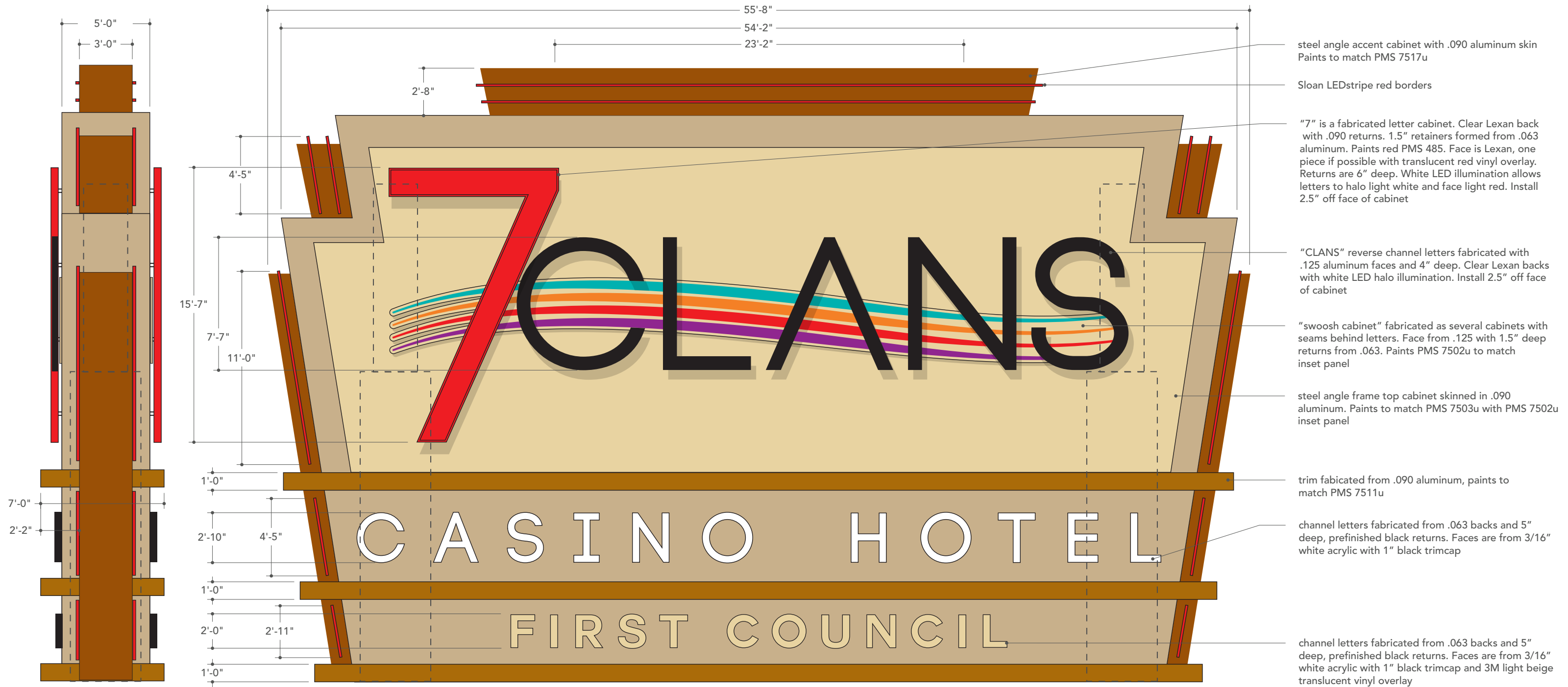
A END VIEW scale: 3/16" = 1'-0"